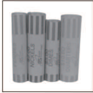
Coin Wrapper Starter Pack